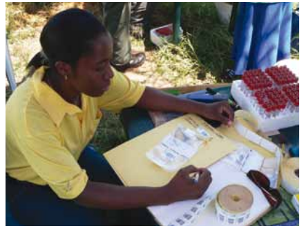
The ARC offers a variety of services to clients in the farming sector.

Lack of knowledge, information and skills are key factors contributing to poor agricultural productivity. The Agricultural Research Council (ARC) has embarked on a drive to assist farmers in all categories to address these challenges.