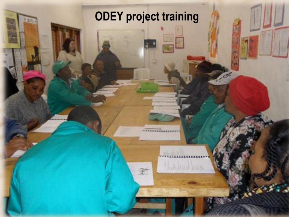
ODEY project training