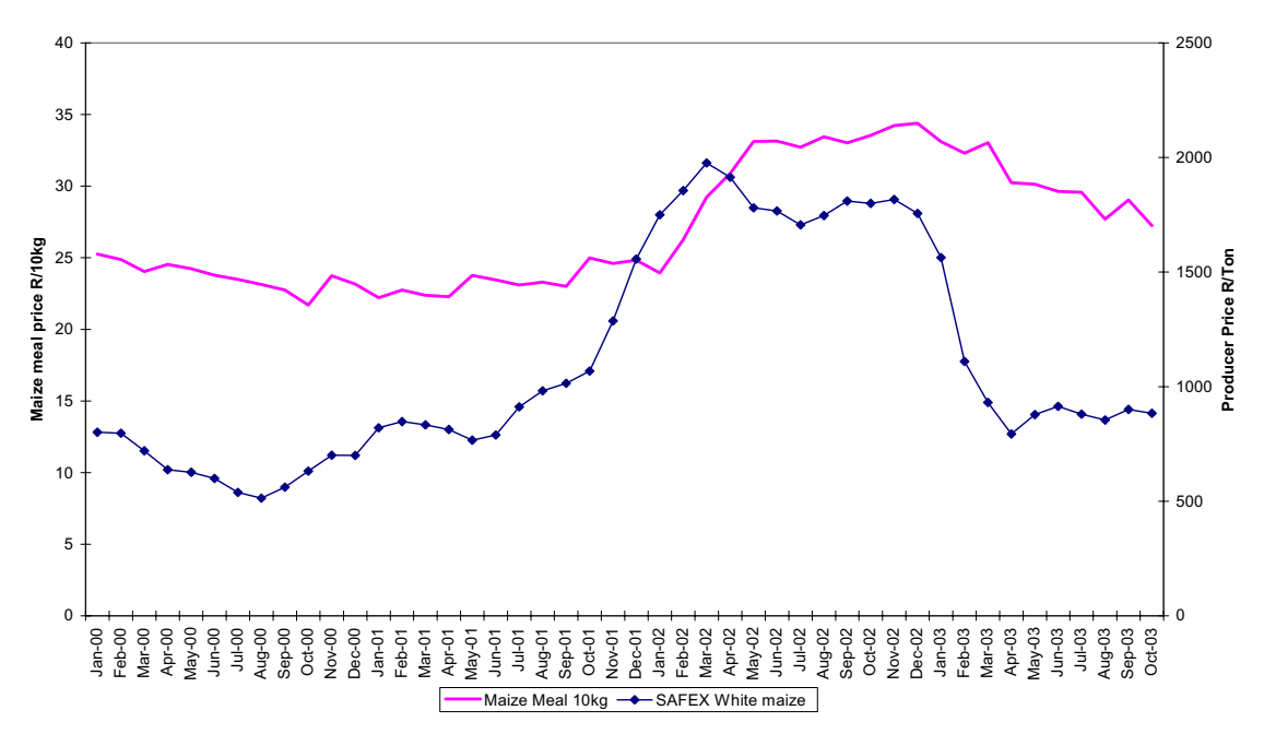
Figure 2: National average retail price for 10 kg maize meal: Jan 2000 to Oct 2003