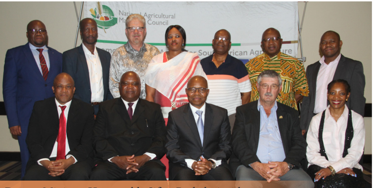
Deputy Minister, Honourable Sifiso Buthelezi with NAMC Council