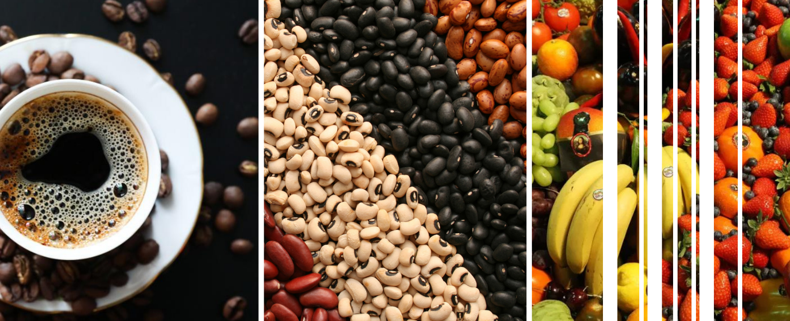
Table 2: Percentage change in a basic NAMC food basket (28 item) prices