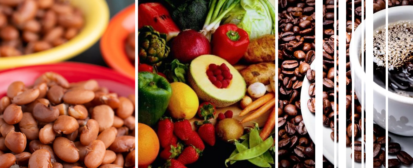
Table 2: Percentage change in a basic NAMC food basket (28-item) prices