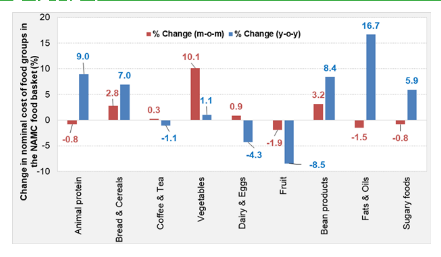
Figure 2: Nominal cost growth of specific food groups within the NAMC's 28-item food basket, comparing October 2021 vs. October 2020 and October 2021 vs. September 2021

Globally, during October, commodity prices were recorded the highest since mid-2011 (FAO, 2021). The FAO food price index averaged 133.2 points which was 3% higher month-on-month and 31% higher year-on-year. These developments were supported by vegetable oils and cereals which were 9.6% and 3.2% higher month-on-month, respectively. Based on the International Grain Council data, the wheat sub-index remains the highest at 43% year-on-year. On the 11<sup>th</sup> of November, the rice-sub index was 11% lower year-on-year, and this is reflected on lower global prices. Following good harvests in key rice producing countries supplies are higher supporting export prices.