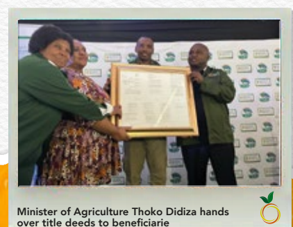
Minister of Agriculture Thoko Didiza hands over title deeds to beneficiary