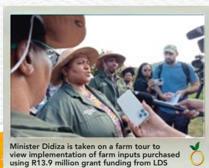
Minister Didiza is taken on a farm tour to view implementation of farm inputs purchased using R13.9 million grant funding from LDS