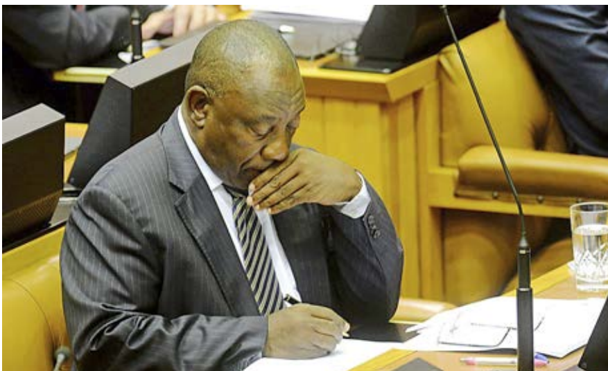
President Cyril Ramaphosa

The bad news is that Ramaphosa is still playing for time, to the country's