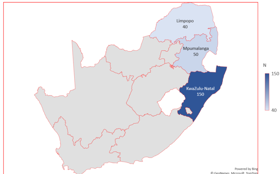
Figure 1. Area of study.

reducing bias and increasing sample representativeness. Following the data collection phase, the questionnaire responses were manually entered into a spreadsheet for further analysis. Data management processes such as data cleaning and coding were used to ensure the accuracy and consistency of the data.